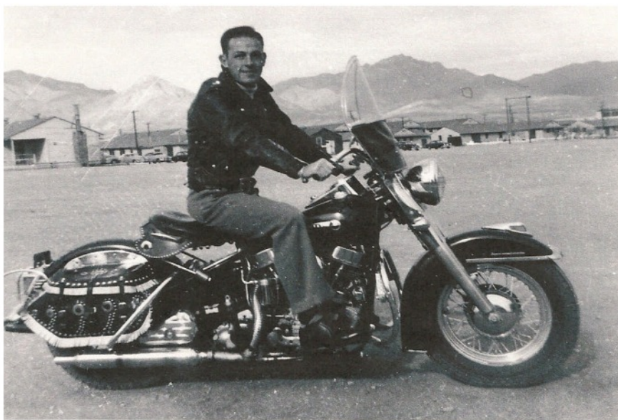
October 1951, Fort Bliss, TX