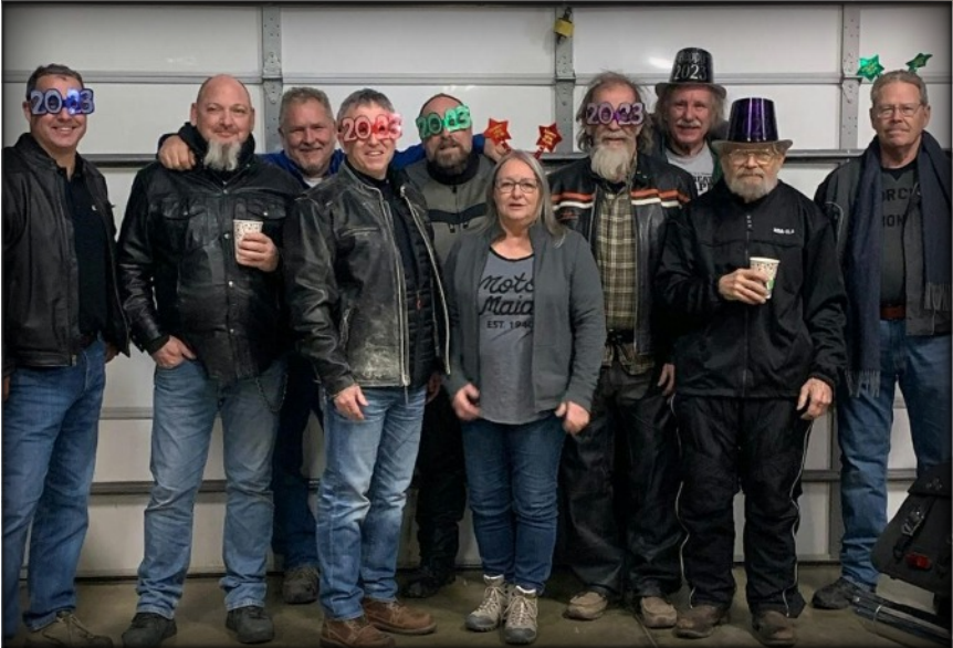
Toasting the New Year with hot chocolate.