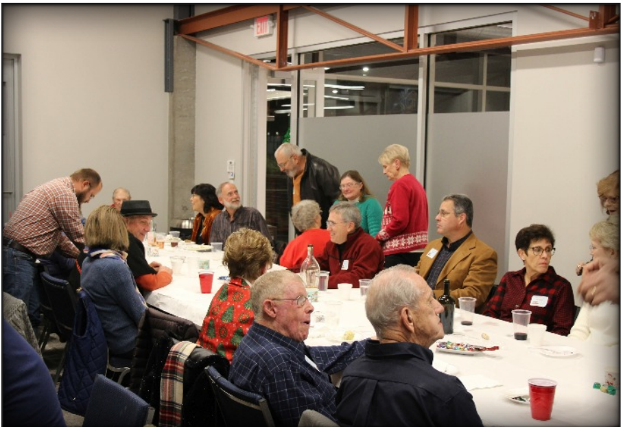
The CGP Group venue was very nice