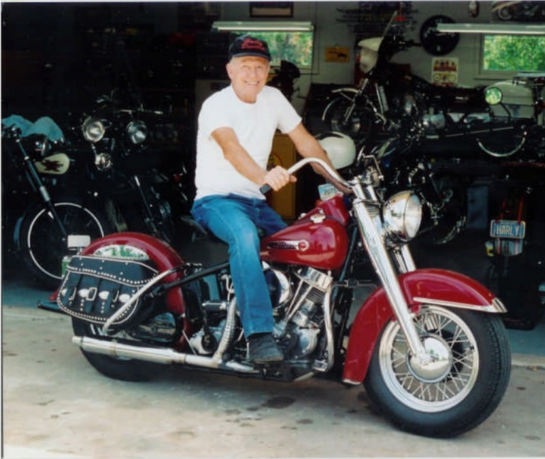
The “Joker” 1950 Panhead, Restored-2003