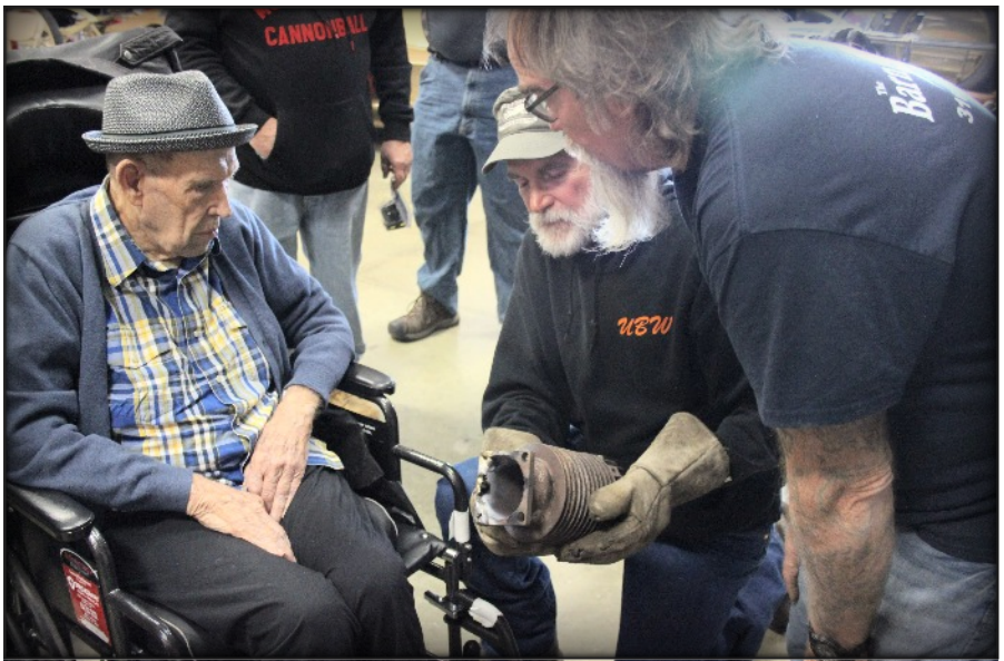
Buud casts a skeptical eye at the welds