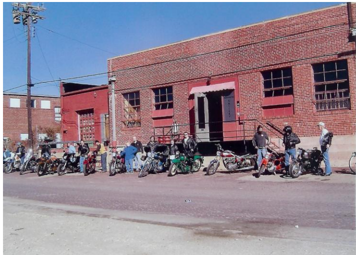
Bikes parked in front of the Go Away Garage